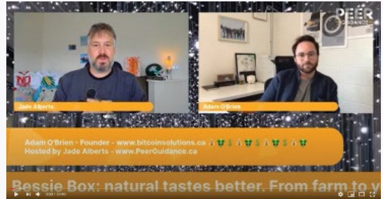
CEO Interview: Telling It Like it Is - Peer Guidance