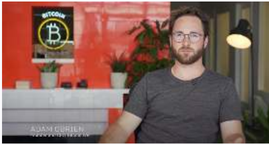
What is Bitcoin Well?