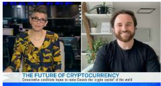
CTV News CEO Interview: The Future of Cryptocurrency